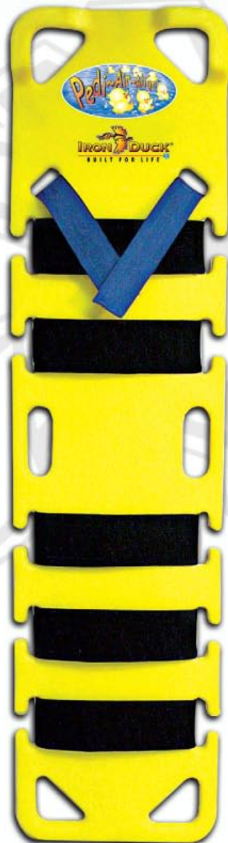
*Pedi~Air~Align Shown with Straps.