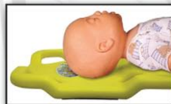
Patented Dual Plane Headrop System.

The Pedi-Air-Align Complete System includes: 1 board, 1 shoulder restraint, 1 chest strap, 4 body straps, 2 wrist restraints, 6 disposable head blocks, 6 disposable head block straps, and 1 carry case. Board size is 48" x 12" x 1.75". Lifetime guarantee.