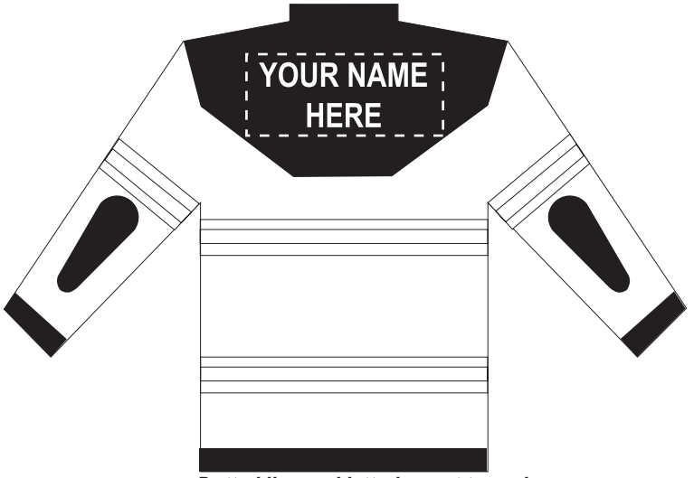
Dotted line and lettering not to scale.